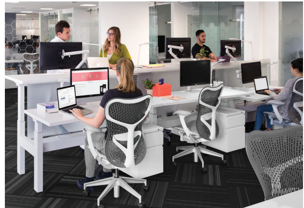
Ibotta employees value their Renew Link workspaces, which, when paired with Mirra® 2 Chairs and Flo Monitor Arms, offer a high-performance ergonomic benching solution.

Ibotta turned to Herman Miller and Workplace Resource of Colorado, a Herman Miller Certified Dealer, to help create a more ergonomic space that lowers the barriers to effective collaboration both within and across teams.