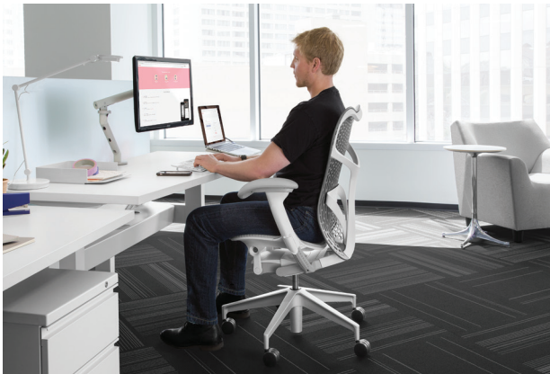
Ibotta’s new workspace facilitates individual focused work while providing opportunities for various types of group interaction throughout the space.