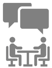
Collaboration Spaces for Teamwork

If you feel your space doesn't support these activities now, give us a call to discuss the best methods of integration.