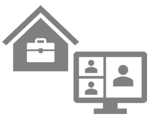
Connection with Remote Workers