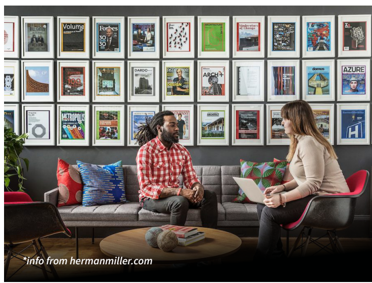
*info from hermanmiller.com